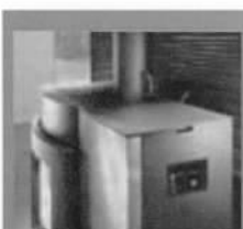
The Induo stove from Rika won the "Domestic Heating" category. This highly acclaimed hybrid stove can switch seamlessly from wood logs to pellets in the same furnace without manual intervention, reaching an efficiency of 90 % with either pellets or logs.