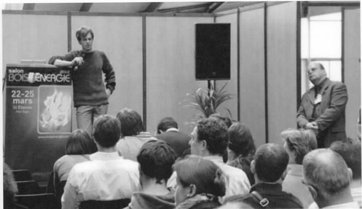
Well attended on the Salon floor seminars.