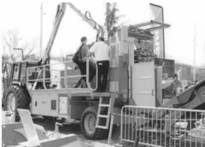
Above, if you can't take the wood to the yard, take the yard to the woods, French Rabaud displayed a mobile firewood factory ideal for farmers wanting to scale up production and mobility