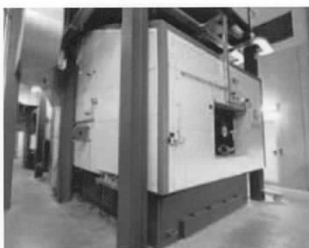
The winner of the "District Heating" category - the K12 Furnace from Kohlbach. A furnace with cooled moving grate and vertical tertiary combustion chamber, for boilers from 6 to 18 MW allowing combustion of very moist fuels with very high ash content.

The next Salon Bois Energie is to take place 20-22 March 2013 in Nantes, West France